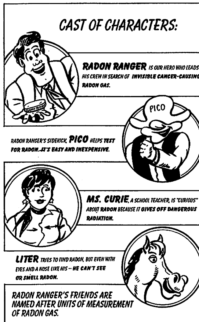
Figure 3. Introducing The Characters

A front page was added to introduce the four characters and explain that Radon Ranger's friends are named after units of measurement of radon gas (see Figure 3).