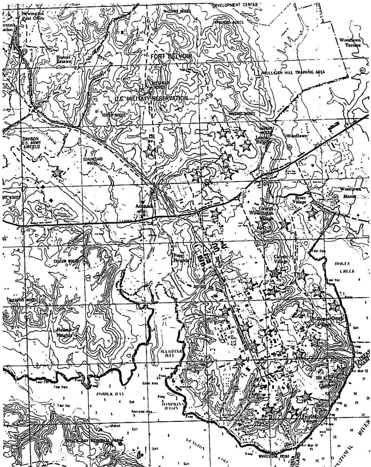
Figure 3. Fort Belvoir testing locations